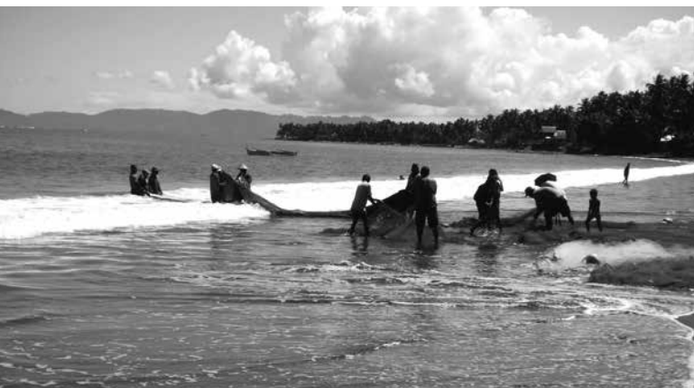
Fishermen on the Philippines. The Permanent Court of Arbitration ruled against China, in part because China impeded the Philippines' fishing activities within the latter's 200-nautical-mile-wide Exclusive Economic Zone (EEZ)